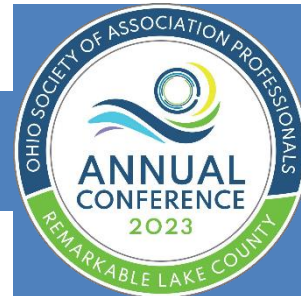
Exhibit tables are a terrific way to showcase your product or service to OSAP's captive-member audience! Various session breaks are scheduled throughout the conference to encourage table visits and one-on-one conversations with you or your company's representatives.